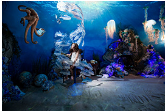
Adrien Broom, Blue , 2014, digital print on matrix fabric, 40 x 60 inches

Designed to evoke and capture a sense of childhood fantasy, A Colorful Dream tells a simple coming-of-age story in rich symbolic language that takes the viewer on a journey through the entire spectrum of the rainbow.