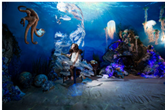
Adrien Broom, Blue , 2014, digital print on matrix fabric, 40 x 60 inches

Designed to evoke and capture a sense of childhood fantasy, A Colorful Dream tells a simple coming-of-age story in rich symbolic language that takes the viewer on a journey through the entire spectrum of the rainbow.